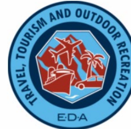
Travel, Tourism and Outdoor Recreation